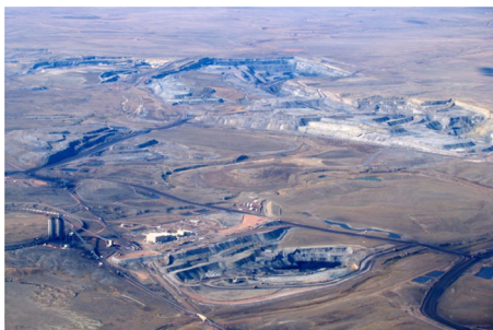
Figure T2.1: Antelope Coal Mine, Wyoming